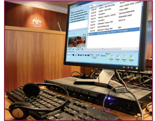
VIQ for Courts