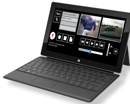
VIQ Touchscreen Interface